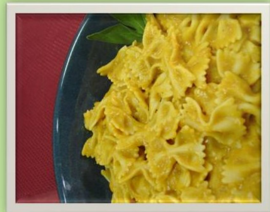
Creamy Harvest Pasta